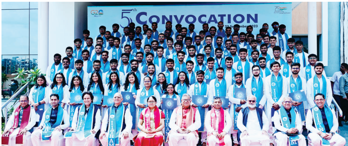
Class of 2023