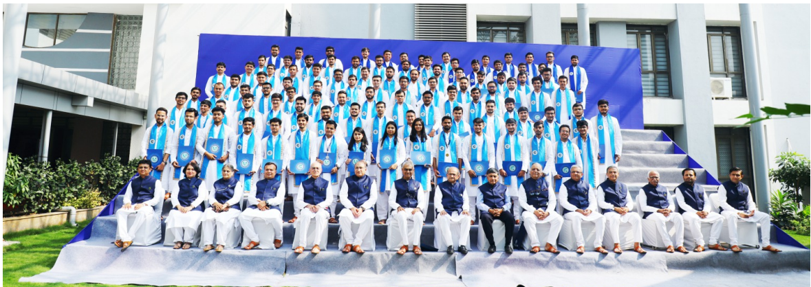
3 rd Convocation: 2019