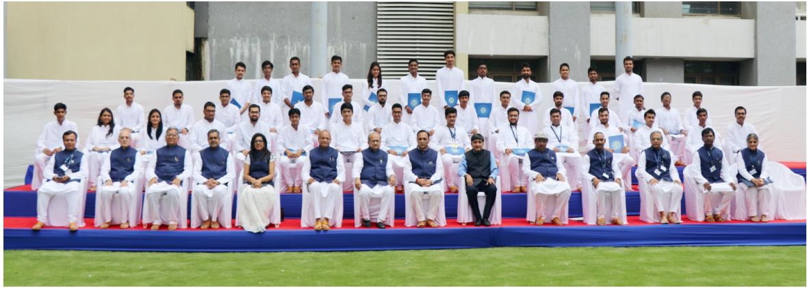
1 st Convocation: 2017