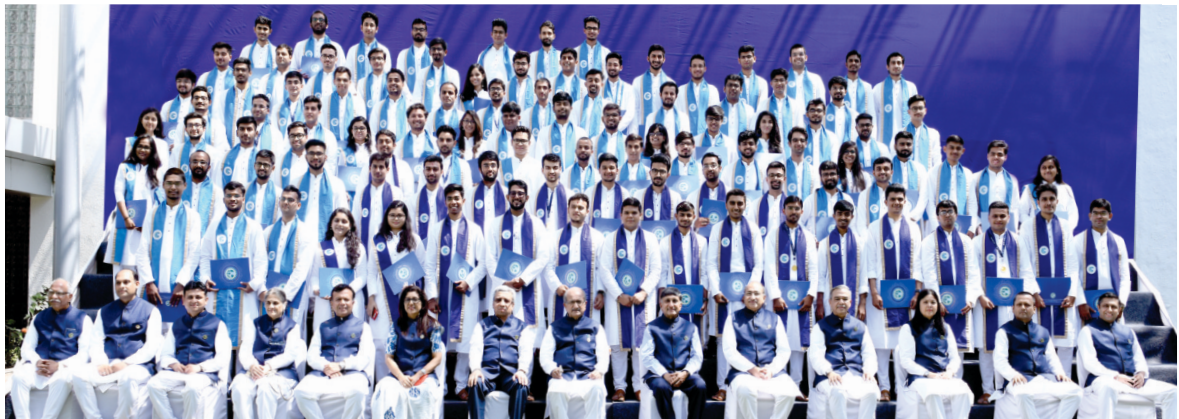
2 nd Convocation: 2018