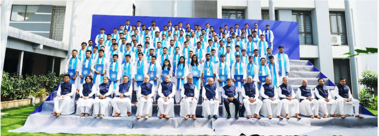
Third Convocation - IITRAM (16 th November, 2019)